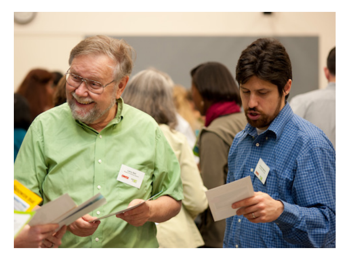
FIGURE 2. Educators and scientists learn a game where participants prioritize the development of new nanotechnologies.