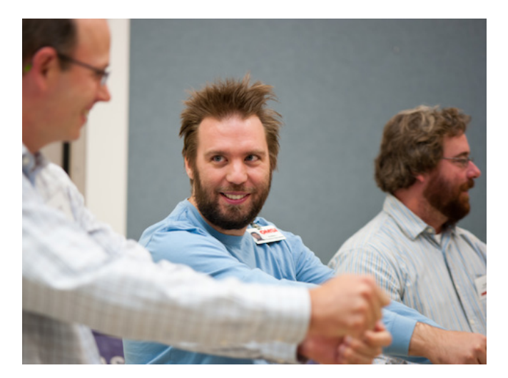
FIGURE 5. Educators and scientists learn an improv exercise that develops their facilitation skills.

In 2012–13, the project team offered multi-day, inperson professional development workshops in four locations across the United States. Around 100 professionals from 50 different organizations were invited to attend the workshop. The workshops were organized around the three big ideas. Following an introduction to the project goals and rationale, each unit included improv exercises