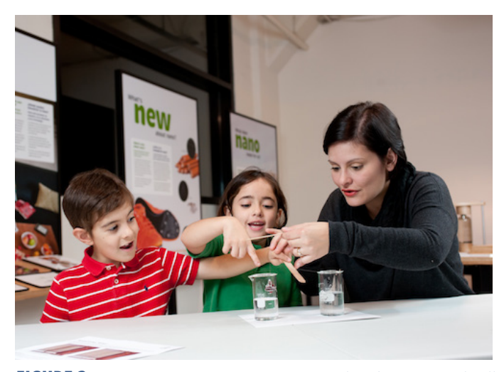
FIGURE 3. Museum visitors experiment with refraction and talk about what would happen if invisibility cloaks existed.

Network educators have identified several techniques that help them facilitate interesting and meaningful conversations. The facilitator first invites participants to try the activity, demo, or game." This introductory experience establishes rapport, provides some basic familiarity with nanotechnology, and introduces a topic for conversation. Then, the facilitator initiates a conversation by asking questions or making observations about what participants say and do. This validates participants' perspectives and establishes a two-way interaction focused on developing ideas, rather than a one-way presentation of information. Then, the facilitator draws out participants' experiences and values related to technologies. The facilitator might reflect participants' ideas, ask open-ended questions, make connections to things participants are familiar with from from everyday life, or offer additional information for consideration. The facilitator gently guides the conversation, following participants' interests and ideas. While the facilitator always has the key concepts in mind, and often has a repertoire of talking points and connections related to a given activity, the conversation never follows a set script. The facilitator also makes sure to involve everyone in the group. Finally, the facilitator