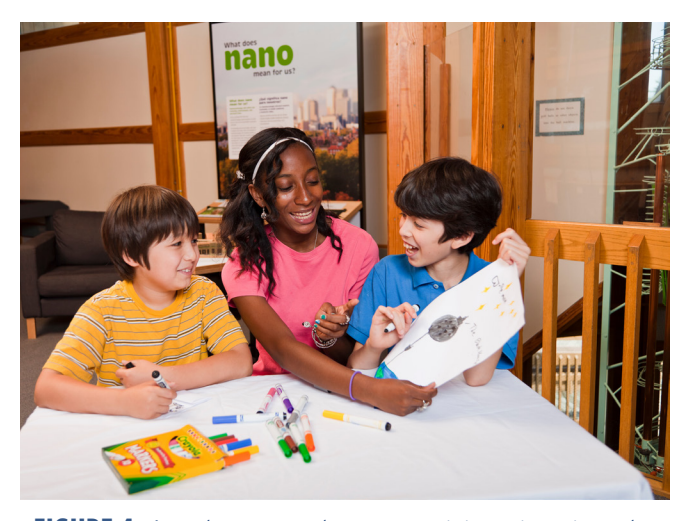
FIGURE 4. An educator and museum visitors imagine what our world would be like if it were possible to take an elevator to space.