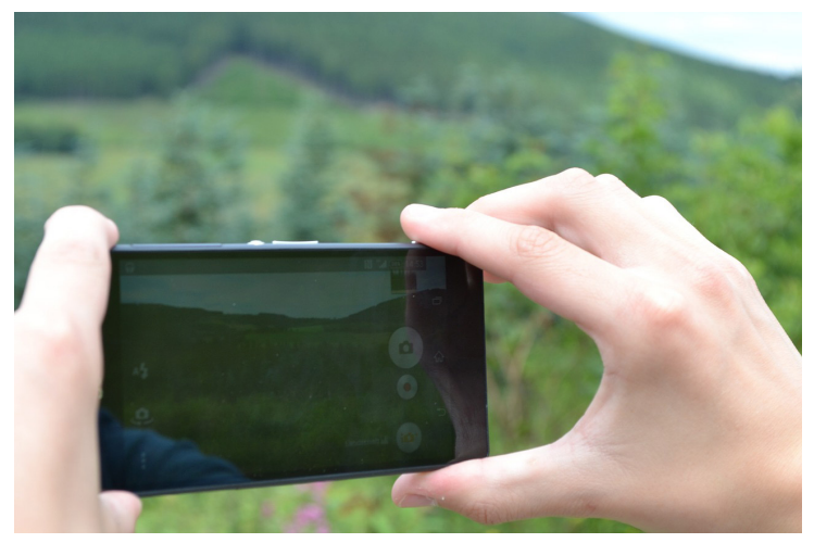
FIGURE 5. In online experiential learning, the world is our lab

Civic engagement centers on making a real-world difference in the community while concurrently developing knowledge, skills, competencies, and abilities to achieve successful course and community project outcomes. Civic engagement can take on many forms in the higher education environment, and it prepares students to be engaged citizens. In our civically engaged experiential learning opportunities, students work on authentic science projects that are designed to make a difference in the community and provide students with real-world experience in science.