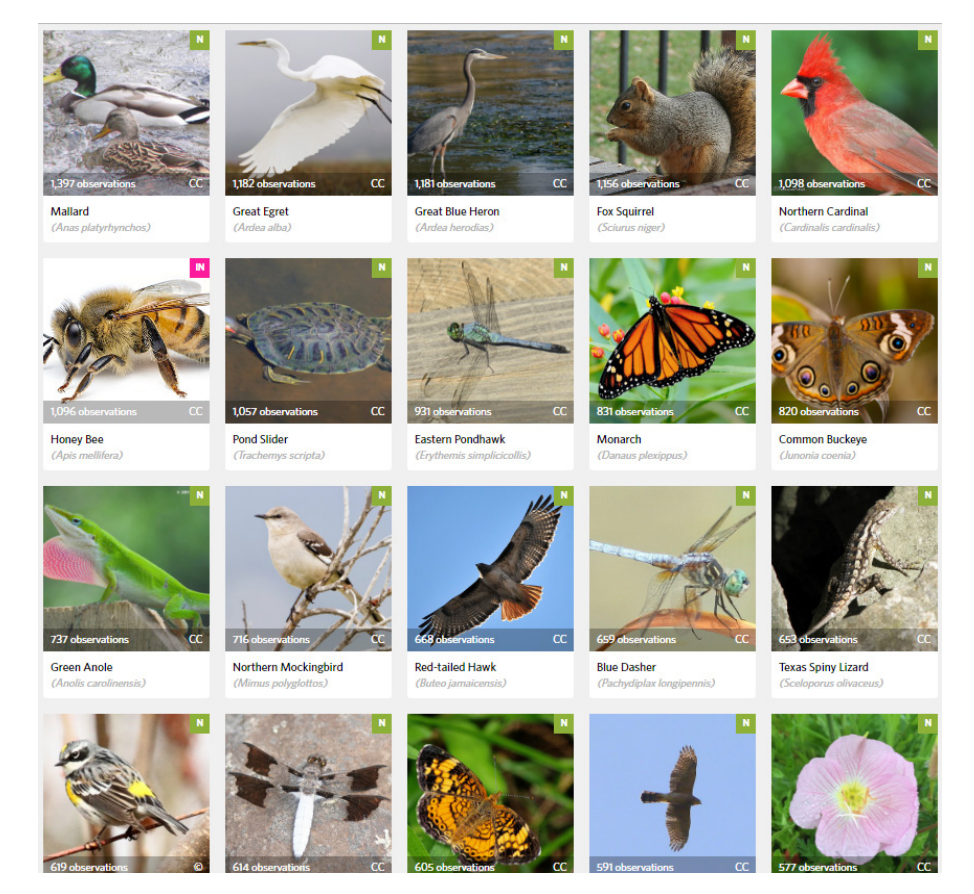
FIGURE 6. Updated Species Guide on iNaturalist