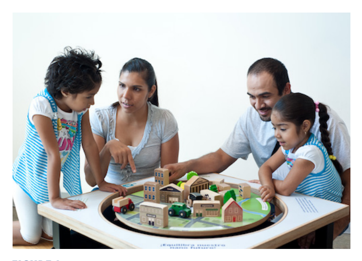
FIGURE 1. Museum visitors use an exhibit challenging them to build a future that includes new nanotechnologies.

As a public engagement process, dialogue has several general characteristics. It involves utilizing facilitators and ground rules to create a safe atmosphere for honest, productive discussion; framing the issue, questions, and discussion material in a balanced and accurate manner;